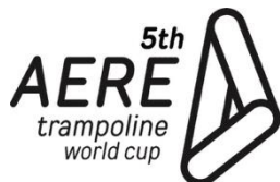
FIG TRAMPOLINE GYMNASTICS WORLD CUP 5 th Aere Trampoline WORLD CUP RICCIONE (ITA) – 4-6 APRIL 2025