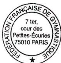
James Blateau President of the FIG affiliated NF (FRA)