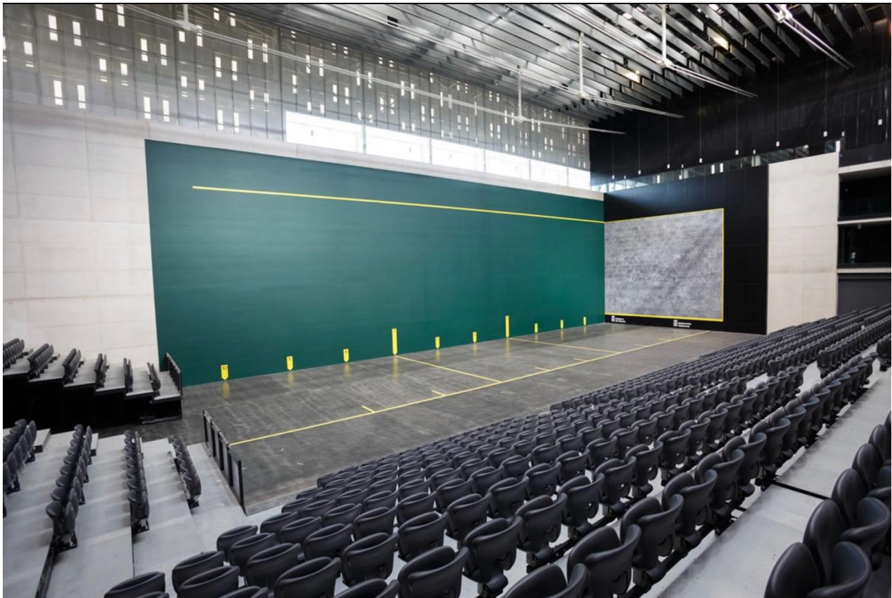
Training / Warm up Hall