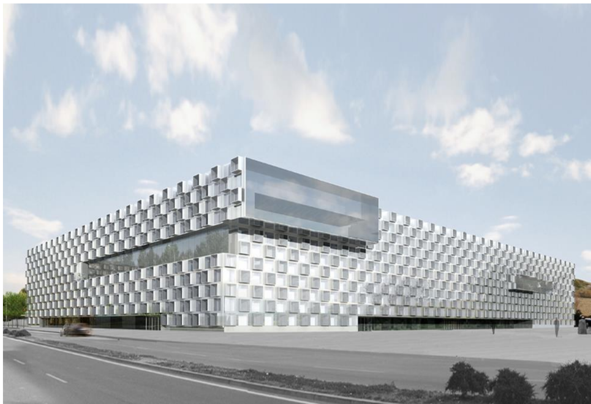
The Navarra Arena